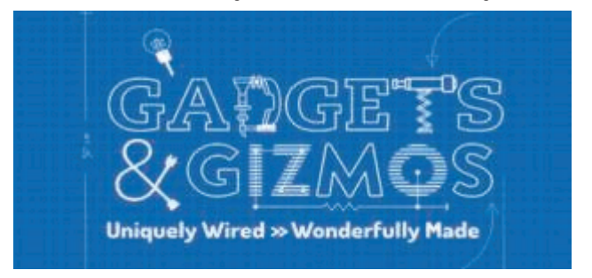
How you made me is amazing and wonderful. I praise you for that. - Psalm 139:14 (NIrV)

This month we are learning about all the things God made and why he made us the way he did!