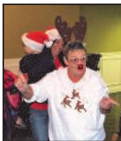
A Rudolph sighting!

December 14, our group serenaded approximately 75 residents and staff with ten of the most popular Christmas songs. Many joined in with our students and volunteers to provide an ole-time Christmas scene where harmony rang throughout. Rudolph, the red-nosed reindeer, even made a surprise appearance! The 30 minute concert brought Christmas joy and cheer to everyone who took part. We're grateful that the Handicapable ministry seeks ways to reach out to the local community and help its members to share the love of Christ with our neighbors!