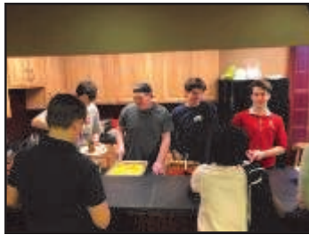
Tutors serving dinner in the Mariposa.

Jumpstart is back after the Christmas break! We have a great group of students who are learning from our high school tutors, having fun in the gym, and sharing dinner together each week. Many of our tutors are from our St. Paul Student Ministry, and in addition to tutoring and leading games, they also serve the kids dinner. Thanks to all our students, adult supervisors, cooks, and other volunteers who make the program possible!