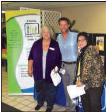
Family Care Council and adp reps