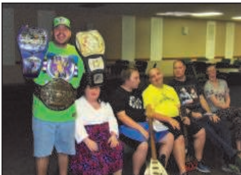
Performers wait to go on stage