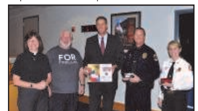
Presenting toys to the mayor and first responders

The Carpenter's Shop makes wooden toys that are given to children who are dealing with traumatic situations. We give the toys to first responders and others in our community who work with children in crisis. When they come in contact with children who are dealing with traumas or emotionally difficult situations, the toys offer some needed comfort and love. The ministry also provides a place for our woodworkers to come together to serve, pray and find direction. Join them in the woodshop behind Open Arms Tues-Thurs from 9 a.m. to noon.