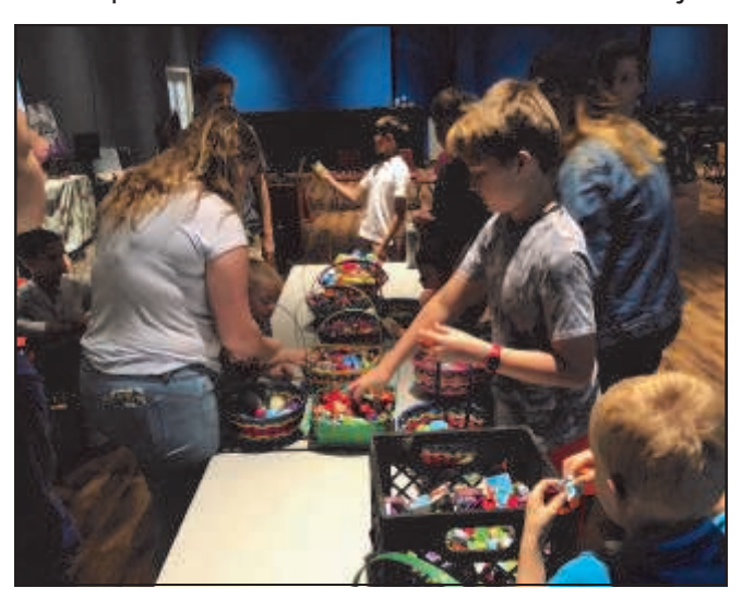
Kids Invite Neighbors to Easter

This Easter our Treehouse Children Ministry created Easter Baskets to invite families in the kids' neighborhood to join us for Easter. We had 47 kids participate in praying over these families and creating a fun way to let our community know that St Paul is FOR them!