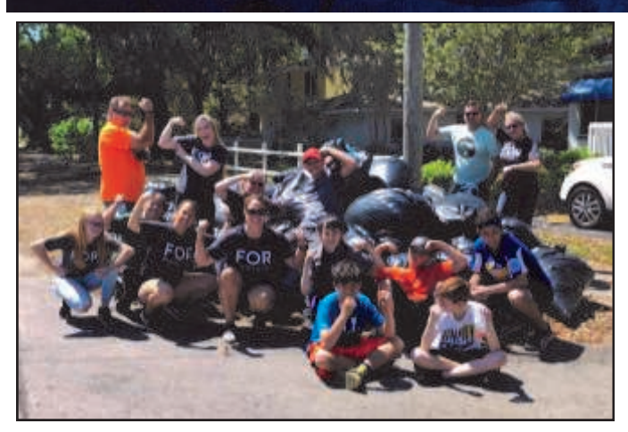
Spring Break Serve Day A group from our Student Ministry served by doing yard cleanup and more at RCS Grace House! Awesome job!