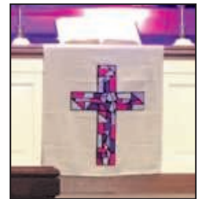
Stained glass cross formed from the broken pieces