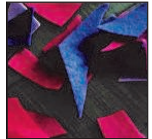
Pieces cut on Ash Wednesday