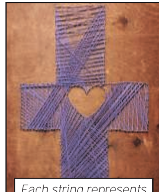
Each string represents a child's prayer