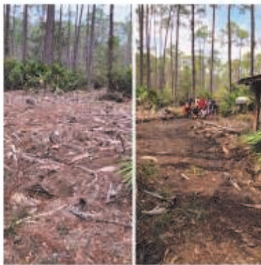
Clearing debris on day one: before and after