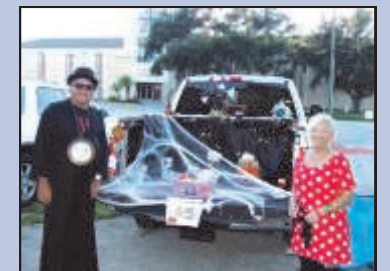
At the Patch Bash