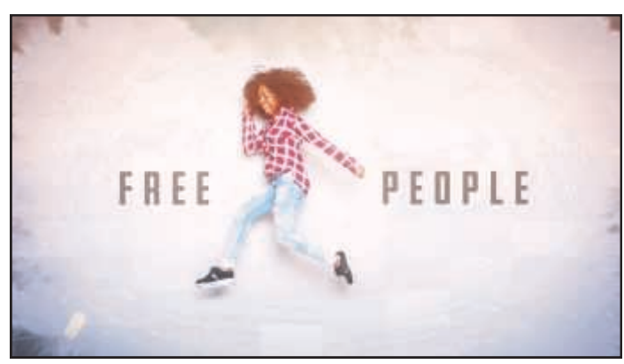
TONIGHT: Free people stay close to the source of their freedom.

Middle school and high school students are invited to join us tonight for group games, exciting crowd breakers, passionate worship, biblical teaching, and a chance to connect with others through Small Groups. The group meets in the Mariposa Café, in the Christian Life Enrichment Center at 5:30 p.m. for dinner, then branches out depending on activities. Dinner is $3. Register for dinner online in advance: stpaulumc.org.