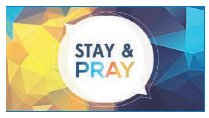
This is the confidence we have in approaching God: that if we ask anything according to his will, he hears us. (1 John 5:14, NIV)