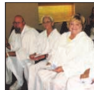
At her baptism