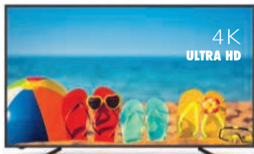
65" 4K ULTRA HD TELEVISION

Some of the items we'll have up for bid include: