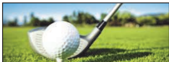
GOLF AT BAYOU AND BELLEVIEW