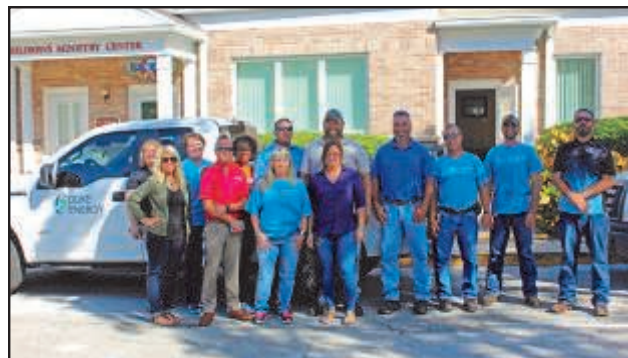
The Duke Energy Team that delivered the food items

Thank you to our amazing Student Ministry Team for all you do!