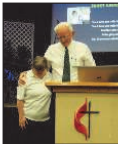
Leading a prayer