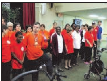
Some of the Special Olympians who were recognized