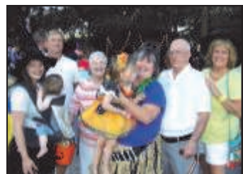
Many kids came in costume