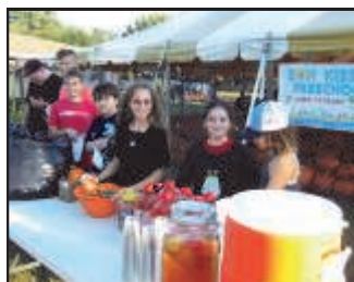
Volunteers helped with snacks and registration, ran games and more.