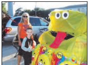
Our volunteers got creative in decorating their trunks for the Trunk or Treat!