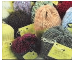
At left tagging 50 hats and scarves for the homeless at the Refuge. At right a few of the 100 hats and scarves made for kids at Ponce De Leon Elementary.